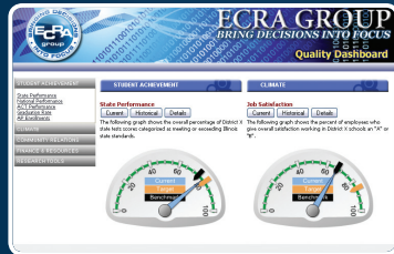
Snapshot of Quality Dashboard